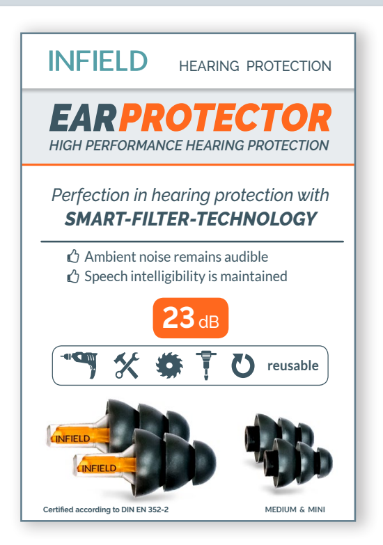
Professional Hearing Protection