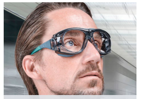
Prescription Safety Eyewear